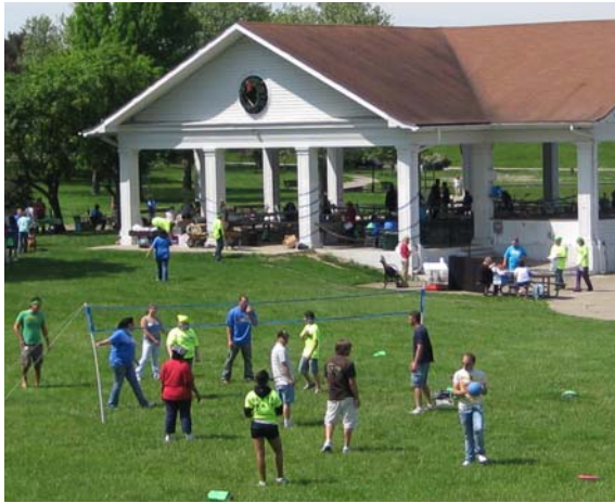
Guests enjoy a picture perfect day at Shawnee Park.

The Greene County office hosted its Community Action Day event, "Getting Back to Basics," in the Shawnee Park Pavilion in Xenia. Guests from around the community enjoyed picture perfect weather, as well as a lunch of fried chicken and all the fixings.