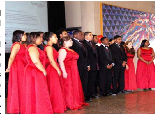
Stivers School for the Arts Chamber Chorus