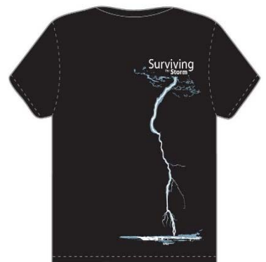
T-shirts are $10-$12

Our "Surviving the Storm" shirts are available in both short and long-sleeved styles in sizes Small to 3XL. The cost is $10 for sizes Small to XL and $12 for sizes 2XL and 3XL. The "Surviving the Storm" golf umbrellas are only $20.