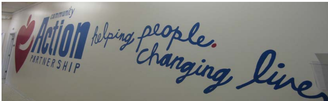
The wall spans about 24 feet along the intake hallway