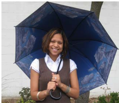
Umbrella's are just $20.

Personally, professionally or economically, we are all surviving some type of storm in our lives. What better way to express this than with a great "Surviving the Storm" shirt or umbrella!